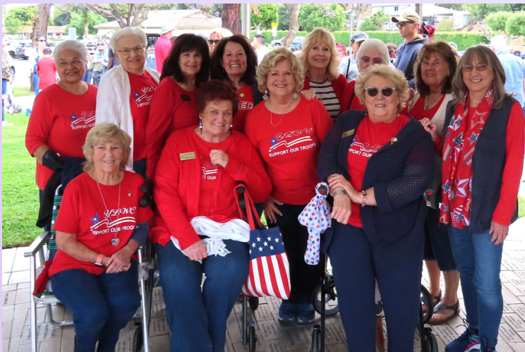
YLWC pays tribute on May 29th at a Memorial Day Ceremony at Yorba Linda Veterans Memorial Park.