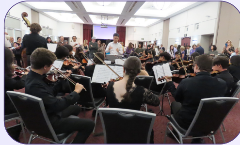
Esperanza High School Sinfonia Orchestra