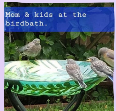
Mom & kids at the birdbath.