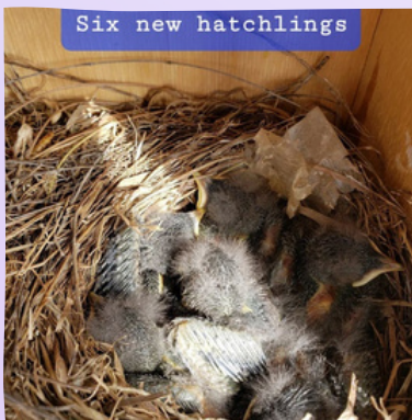
Six new hatchlings