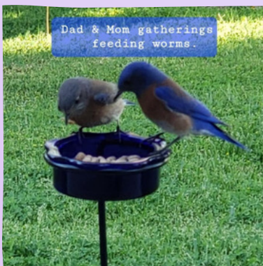
Dad & Mom gatherings feeding worms.