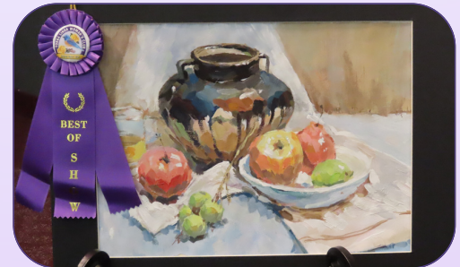
Best of Show