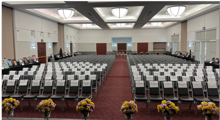
The Calm Before the Storm