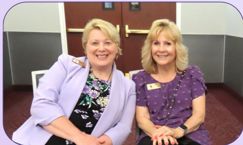
YLWC Past Presidents