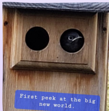
First peek at the big new world.