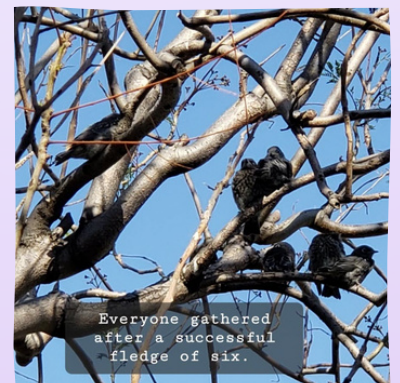
Everyone gathered after a successful fledge of six.