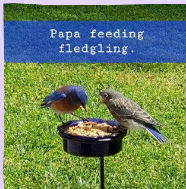
Papa feeding fledgling.