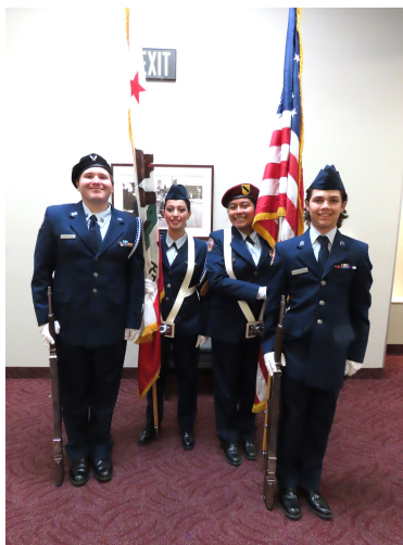
Color Guard from the Junior Air Force ROTC from Esperanza High School