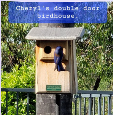
Cheryl's double door birdhouse.

The Western Bluebird is a cavity nester. With the disappearance of natural tree cavities, nest boxes like Cheryl's have stabilized bluebird populations across North America.